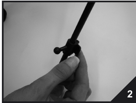
2. Unfold construction, release hitches and adjust their placement according to the size of banner.