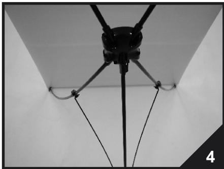
4. Adjust length of the back supporting pole to provide good stability of the stand.