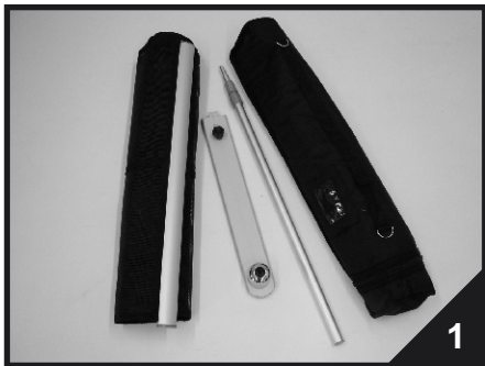
1. Package content of the Nostalgik stand.