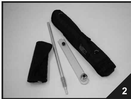
2. Package content of the Fortuna stand.