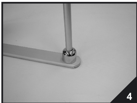
4. Insert telescopic pole into the supporting leg.