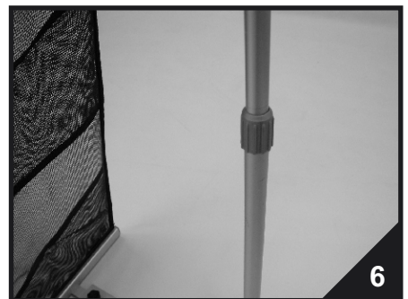
6. Twist the telescopic pole to the left and stretch out the stand. The telescopic pole will be fastened by twisting it to the right.